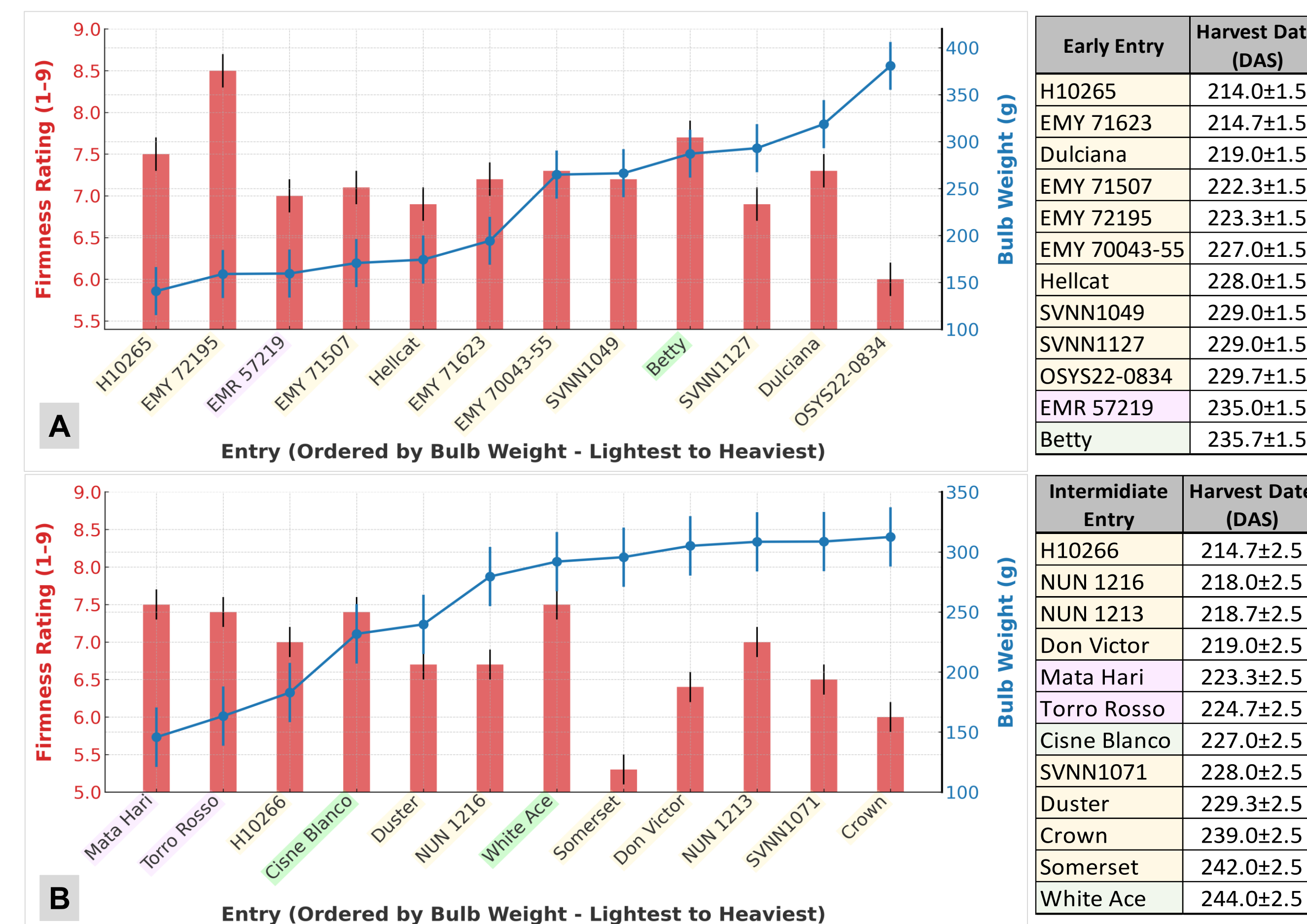
Figure 1. Firmness (bars), bulb weight (line with dots), and harvest date (right tables) for early- (A) and intermediate-maturing (B) short-day onion cultivars. Cultivars are ordered by bulb weight in the graphs and by harvest date in the tables. Background colors indicate bulb color: green = white, yellow = yellow, purple = red. The number in the right tables refers to the number of days after sowing (DAS).

Smaller bulbs tended to be firmer but may not meet market standards (Fig. 1). Days after sowing (DAS) varied among cultivars within the same maturity group. Firmness was moderately correlated with durometer readings, bulb size, and soluble solids (Table 1).