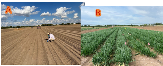
FIGURE 1. A. Direct seeding of onion for the trial on October 15, 2022. B. Late bulbing stage of onion on April 14, 2023.